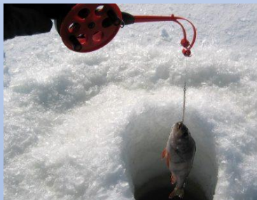
Line hook- o chi kwa chi kan