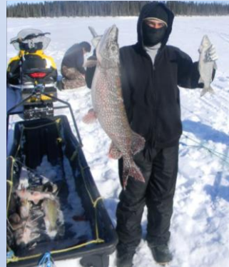
Boggan Sled- o ta pa nask