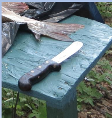
Knife-moh ko man