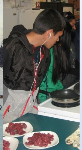
Caribou hunting in O-Pipon-Na-Piwin Cree Nation

"For caribou hunting we need same things as winter fishing. We also need skidoo, bogan, snow shovel to bring the harvest back to the community. We need guns and bullets of course. And some additional equipment that we need for hunting and trapping rabbit in winter are: