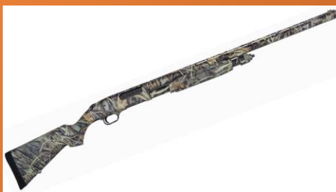
Shot gun- niska sih ni pas kisikan