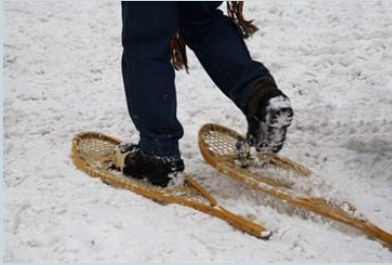
Snow shoes- a-sa mak