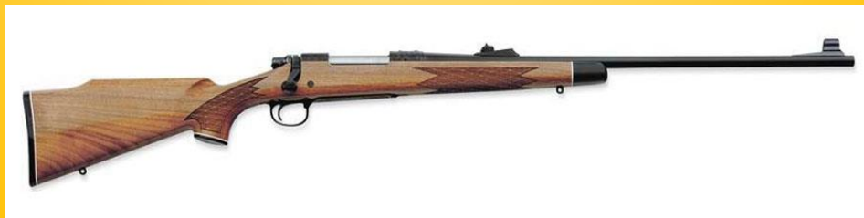
Gun - pas ki si kan