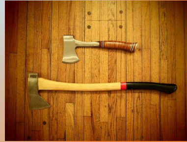
Hatchet- che ka hi kan nes (Small one is a hatchet in the above photo)