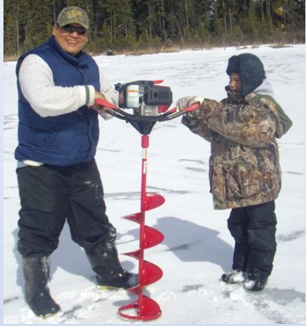
Ice auger- twahikana