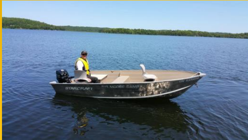
Boat - che man, motor - en chin