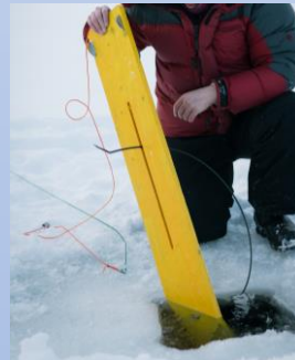
Jigger- si pas se kwa he kan