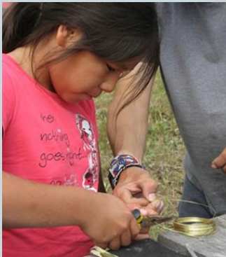
Snare ware- na kwa ka n-i a pew