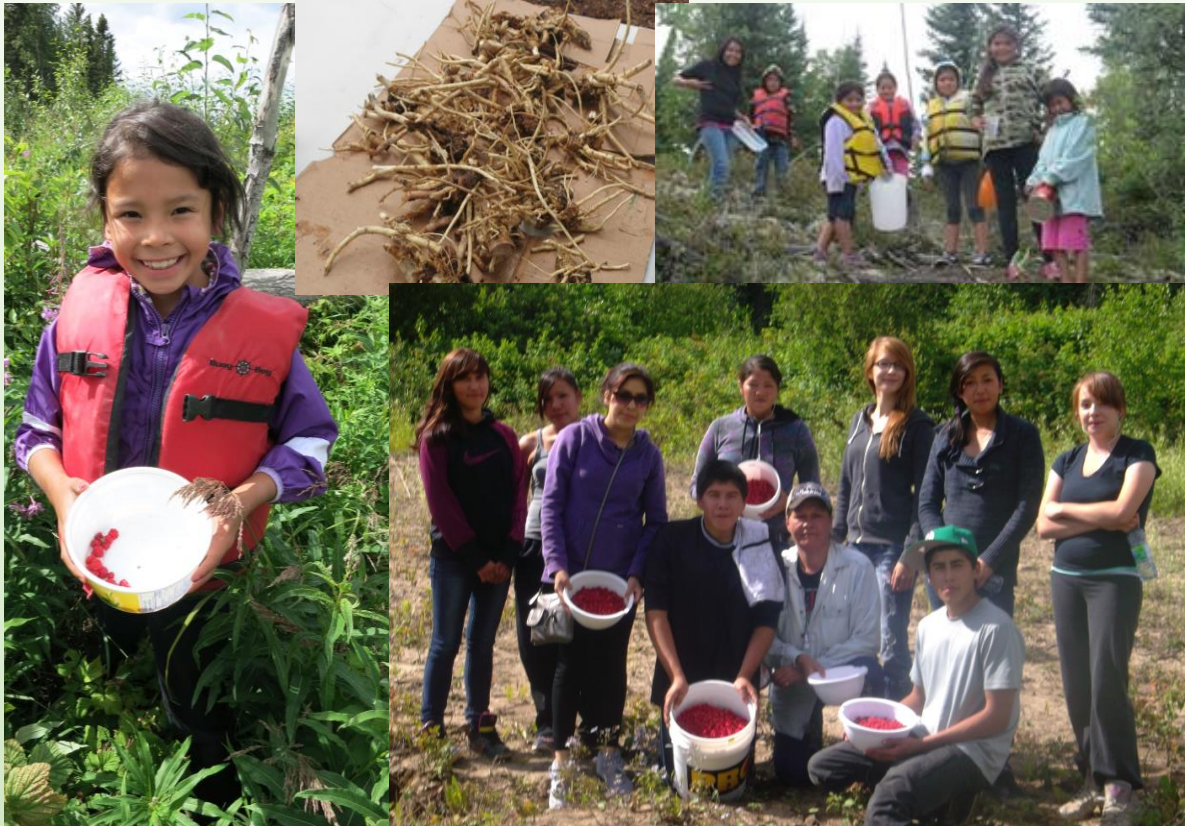
Berry and medicine picking in O-Pipon-Na-Piwin Cree Nation

"During summer we go out for berry picking and medicine picking. Berries and medicines are important part of our diet throughout the year. We pick most of our medicines in July and August. Some of the things we need for berry and medicine picking are: