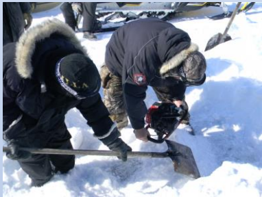
Snow Shovel- makoskwa hi kan