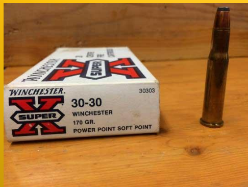
Bullet for moose hunting - moswasihih