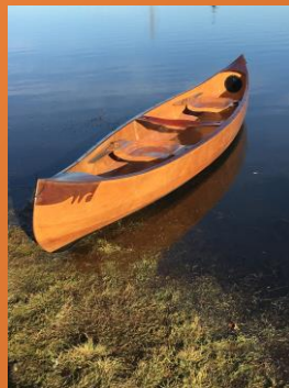
Canoe- che man nes