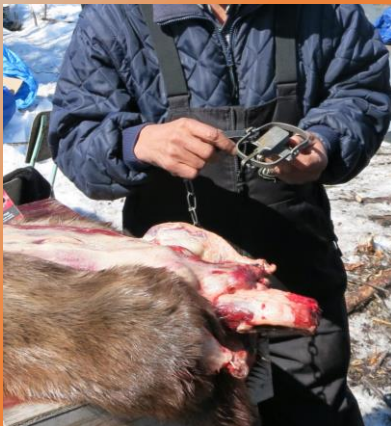
Beaver Snare- a misk ko na kwa ka ne a p-ii