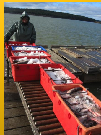
Fish tub - mah kahk