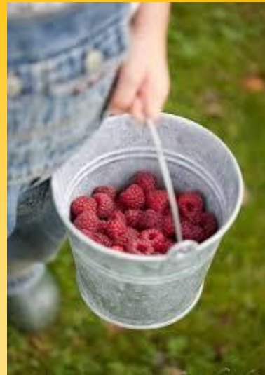
Pail - as kihk