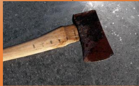
Axe- che ka hi kan