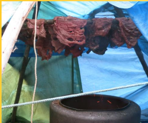
Smoke House - a-kwa wan